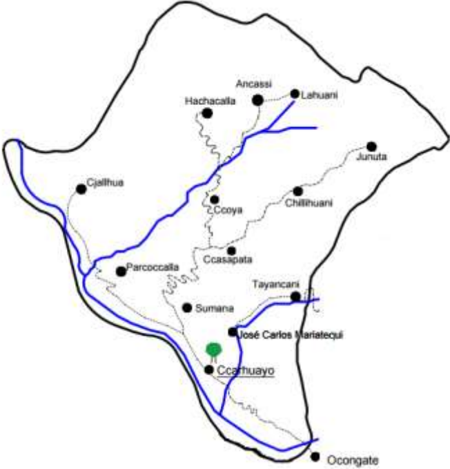
Figure 2 – Overview locations of villages within the Ccarhuayo district

PMR worked in the Ccarhuayo district for three years, during 2011 until 2014. On average, 75% of district inhabitants participated in the PMR project. Because the land in Ccarhuayo is most suitable for forests and extensive livestock farming, implementing a more sustainable and profitable way to manage natural resources in Ccarhuayo was done by PMR through stimulating 1) the plantation of pine trees, 2) a change in animal types and stock, and 3) feeding these animals by cultivated and irrigated fodder instead of natural grasslands. As possibilities for agricultural production are very limited, they were not focused on by PMR.