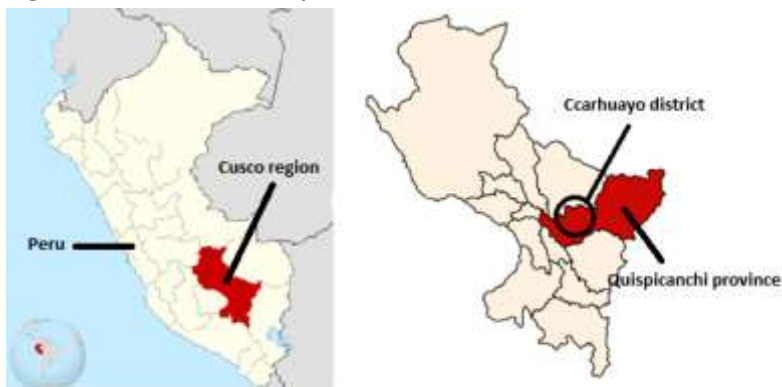
Figure 1 – Overview study area location

Possibilities for agricultural production are limited by the thin soils on hard rock material ( leptosol soils ) (Ministerio de Agricultura y Riego de Peru, 2015), elevation ranges between approximately 3000m and 5000m, sloping land and a lack of water. Instead, the land is most suitable for extensive livestock farming and forests (Raboin and Posner, 2012). Herding is an ancient tradition for Ccarhuayan people. Livestock species important to rural household's livelihoods include sheep, alpacas and guinea-pigs, and to a lesser extent cows, llamas, chicken and pigs. Households depend on their livestock for sources of income, protein, fertilizer and savings/insurance. Compared to